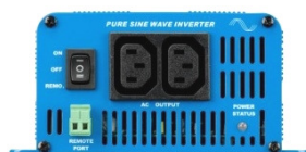
Phoenix Inverter 12/350 with IEC-320 sockets