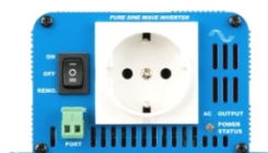
Phoenix Inverter 12/180 with Schuko socket