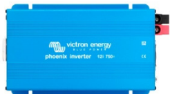
Phoenix Inverter 12/750