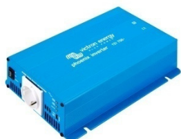
Phoenix Inverter 12/750 with Schuko socket

Connector for remote on off switch available on all models.