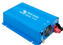
Phoenix Inverter 12/750

A unique feature of the SinusMax technology is very high start-up power. Conventional high frequency technology does not offer such extreme performance. Phoenix inverters, however, are well suited to power up difficult loads such as computers and low power electric tools.